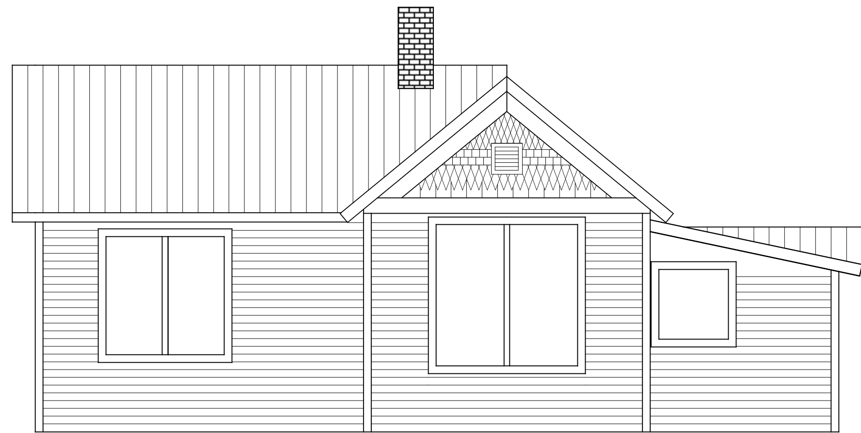
WEST ELEVATION 3 A2