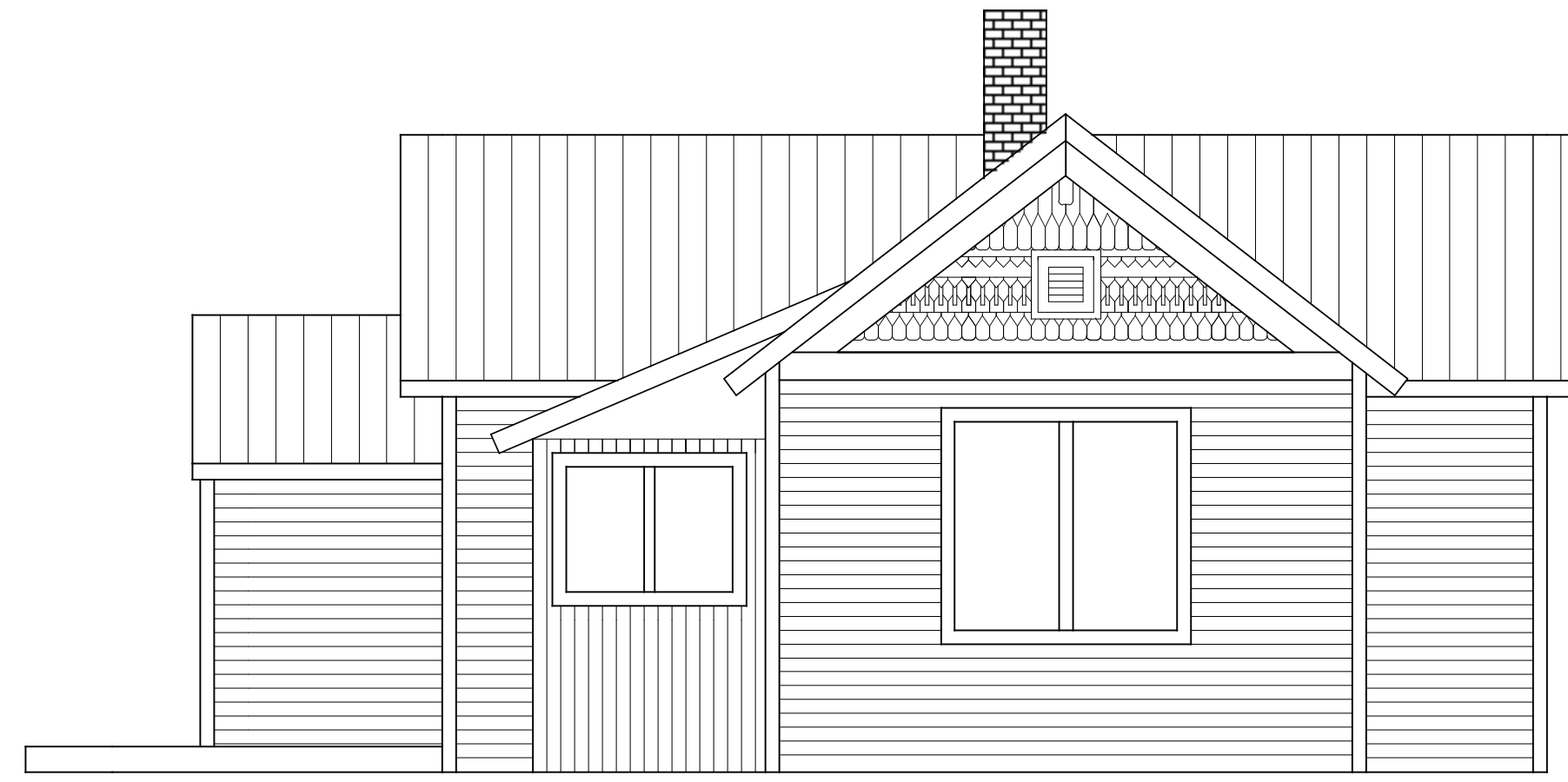
NORTH ELEVATION 2 A2 fourth street side